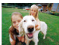
dog fouling in our parks