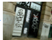
graffiti in our shelters