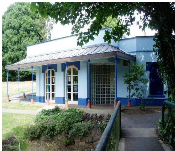
The Manor House